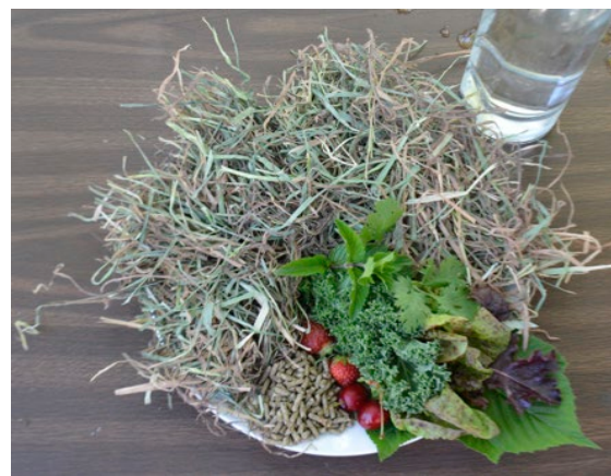
Figure 5. An example of a well-balanced rabbit diet.

See the Nutrition Guide for Rabbits for a complete list of foods that rabbits can – and cannot – eat. https://digitalcommons.usu.edu/extension_curall/2133/ .