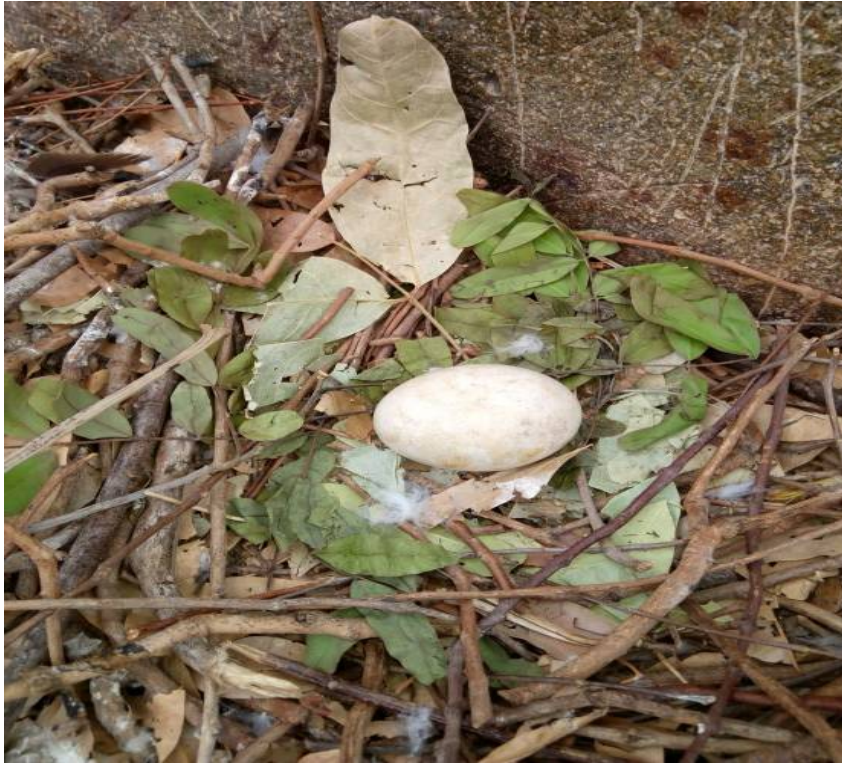
Plate 5: Nest with one egg only