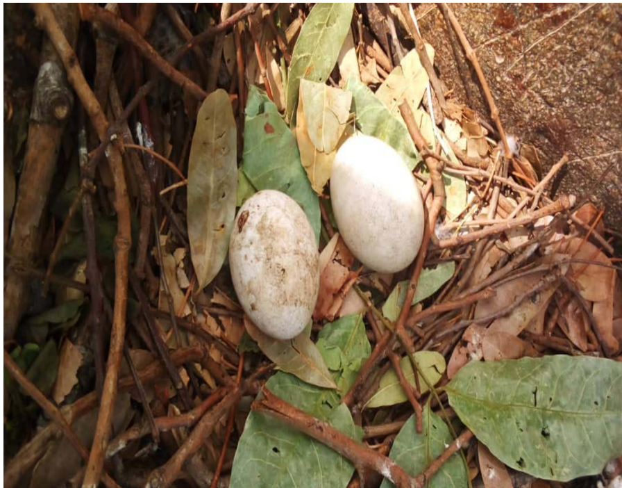
Plate 4: Nest with two eggs