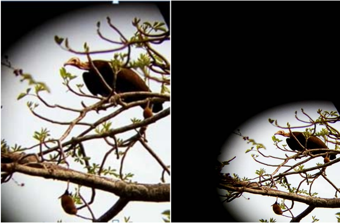
Plate 3: Hooded Vulture Necrosyrtes monachus