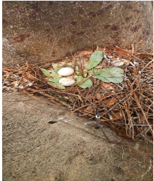
Plate 7: Nesting materials