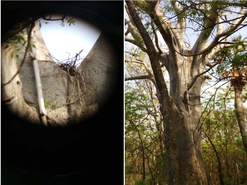
Plate 1: Adansonia digitata on which the nest was sighted and position of the nest on the tree