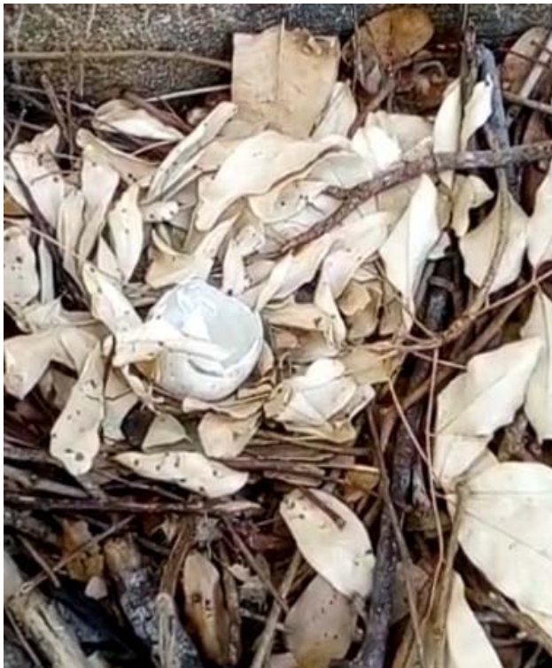
Plate 6: Nest with the shell of the hatched egg