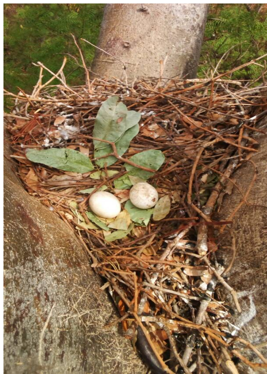
Plate 2: The "Statant-Cupped" type nest