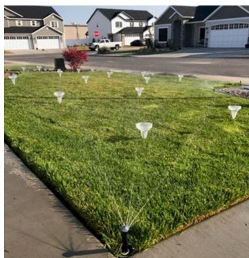
Figure 1. Water Check in progress.

The Water Check program sends trained technicians to your home or business to perform a water audit of your