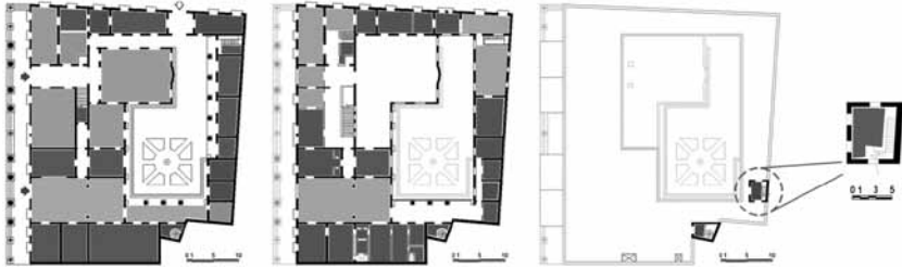
Figure 1. Current Use of Areas of the Martí Provincial Library. Grey signifies public service: reading rooms, computer/internet access labs, and multipurpose spaces. Black signifies staff space for offices, archival collections, and supplies. (Illustration courtesy of the authors.)

The first step taken in this project was the review of the specialized literature on the topic of architectural design in order to determine structural and functional requirements of a contemporary library building. These, described above, were presented to the community, to library users, to librarian colleagues, and to the employees of the institution itself. This was accomplished by means of a focus-group session so as to achieve broad participation in the discussion. A consensus was reached regarding which new services the library should take on, as well as regarding which areas of the building were currently underused, or which might be most effectively adapted for new functionalities. The results of the session are provided in the following images, which are diagrams of how the library spaces are currently used and the areas that have potential to be readopted two new functions (see figs. 1 and 2).