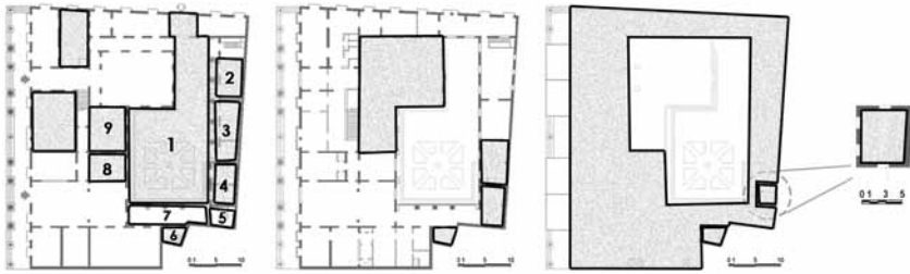
Figure 5. Proposed Design for Spaces and Services in the Martí Provincial Library: 1) patio; 2) learning workshops, i.e., makerspaces; 3) cafeteria; 4) business incubator; 5) toilet; 6) design/print service; 7) periodical/newspaper reading room; 8) digital learning and creation lab; and 9) multipurpose room. (Illustration courtesy of the authors.)

mal study and reading as well as a space for relaxation during the daytime hours during which the library is open. Second, it will be a place for social gatherings, motivational activities, and cultural activities. These will take place on weekends and in the evenings, in addition to the cultural activities that the institution offers. Organizational gatherings and other group activities will have their place as well.