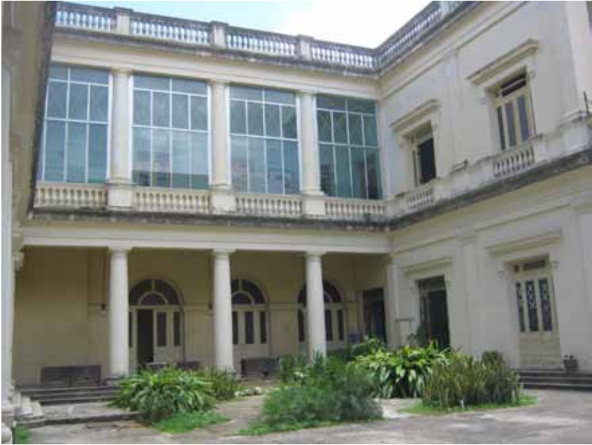
Figure 4. Current Appearance of the Central Patio of the Provincial Government Palace, now the Martí Provincial Library.