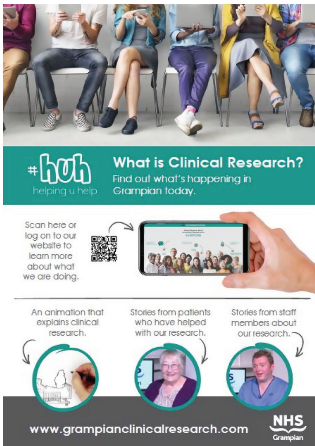
Figure 1: Poster promoting the website

gather additional information, such as what the respondents would be interested to hear about research or how they had been previously involved in research. The survey also asked them their age range and what was their preferred communication channel. Most questions offered predetermined answers to select from (for example: yes, no, maybe), but there were also some open questions, so any additional relevant information could be provided.