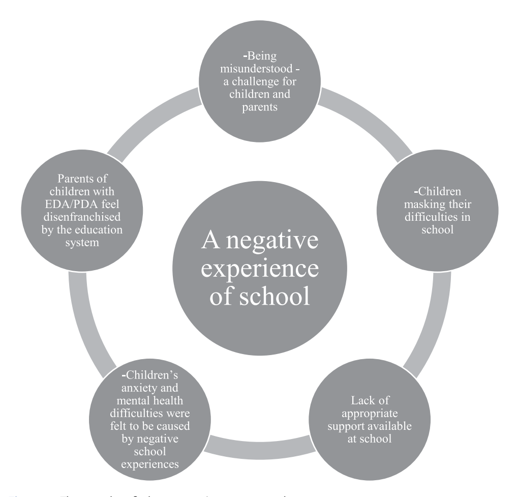
Figure 1. Themes identified in parents' responses to the open survey question.

lack of understanding of autism and, in some cases, PDA: 'We are currently very restricted in terms of accessing basic services due to chronic lack of PDA understanding (and ASD!)' (AUT-EDA). In the few instances in which parents reported a positive experience, they felt their child was understood by school staff: 'School have got the measure of him and support him brilliantly' (AUT).