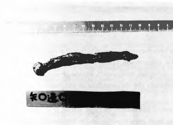
Fig. 3. Gross specimen of the resected bone