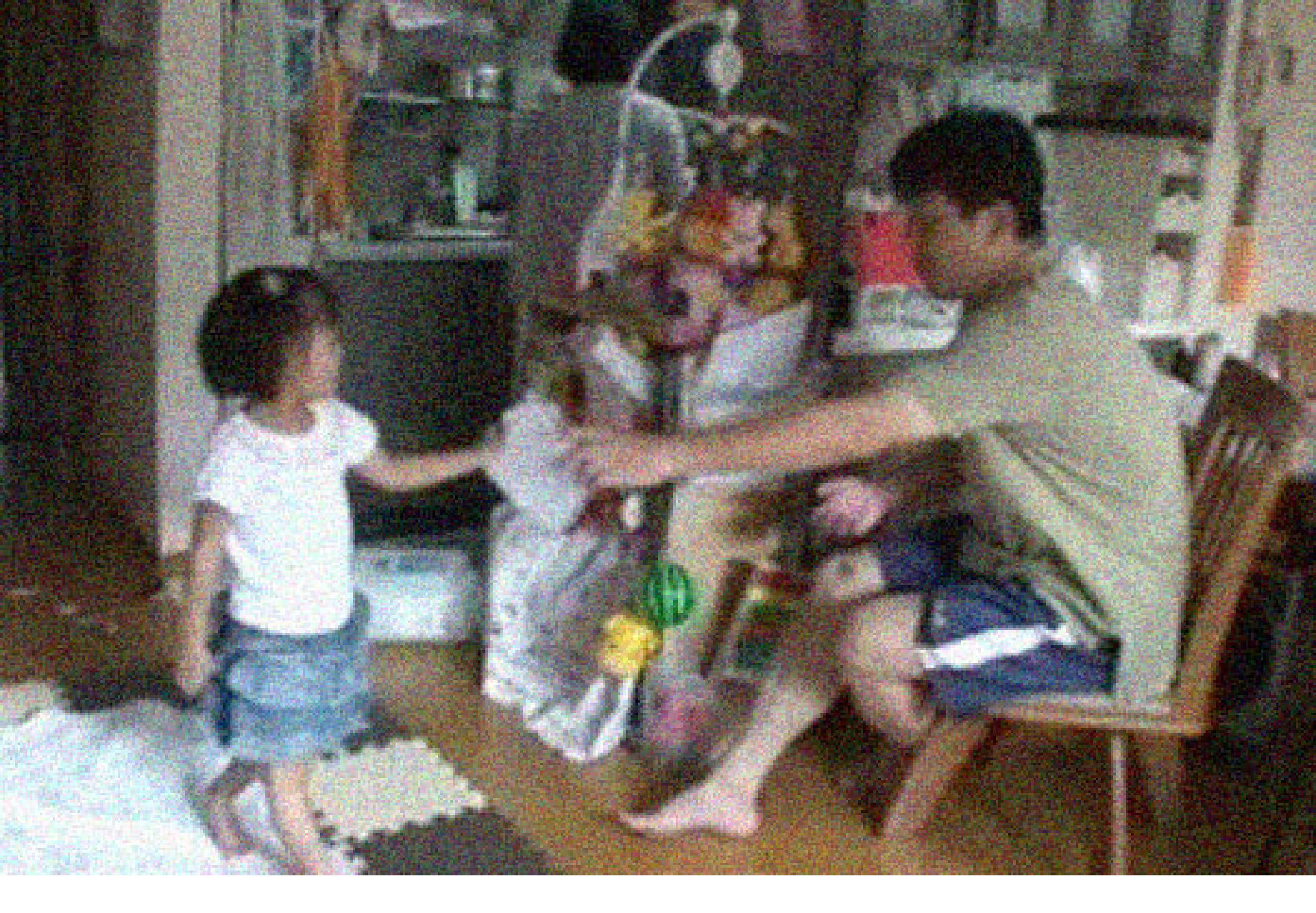
Figure 2 Ay gives the box to F (Example (1): line 9).