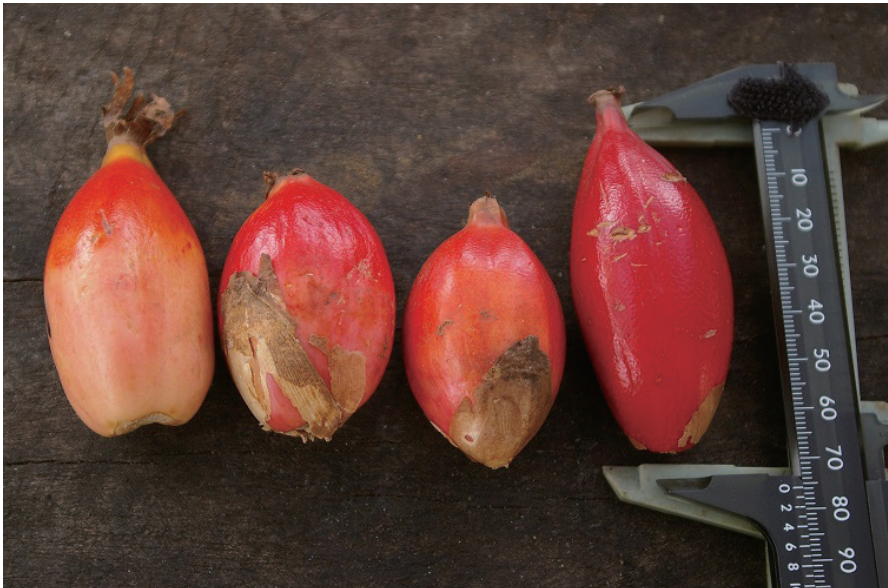
Fig. 6. Fruits of Aframomum mala