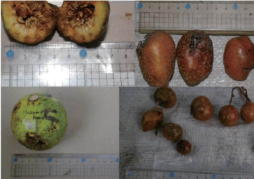
Fig. 3. Foods eaten by chimpanzees during the second half of the dry season in Ugalla