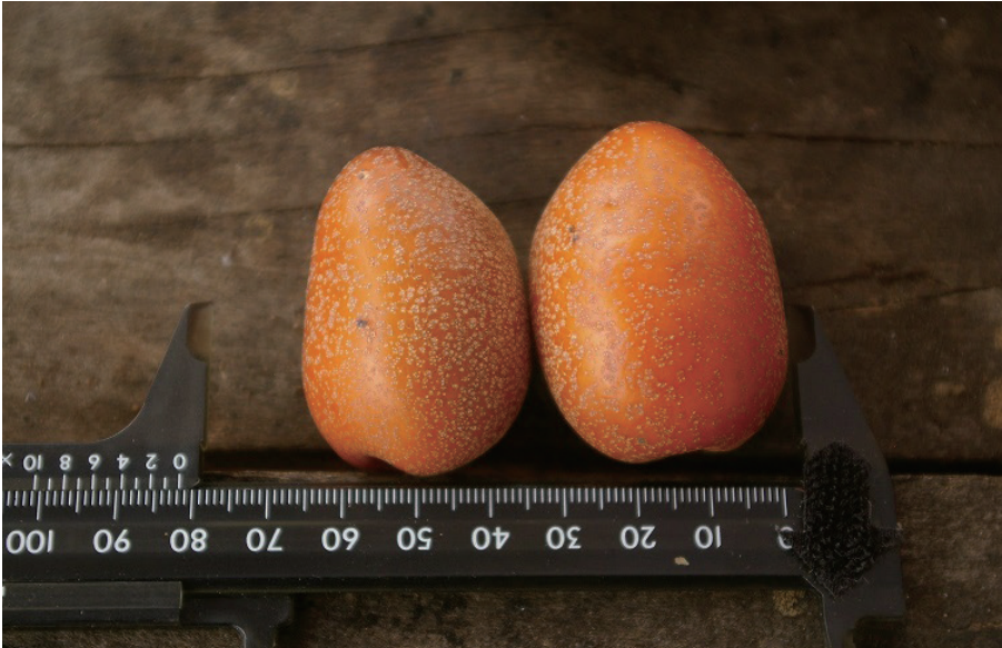
Fig. 5. Fruits of Parinari curatellifolia