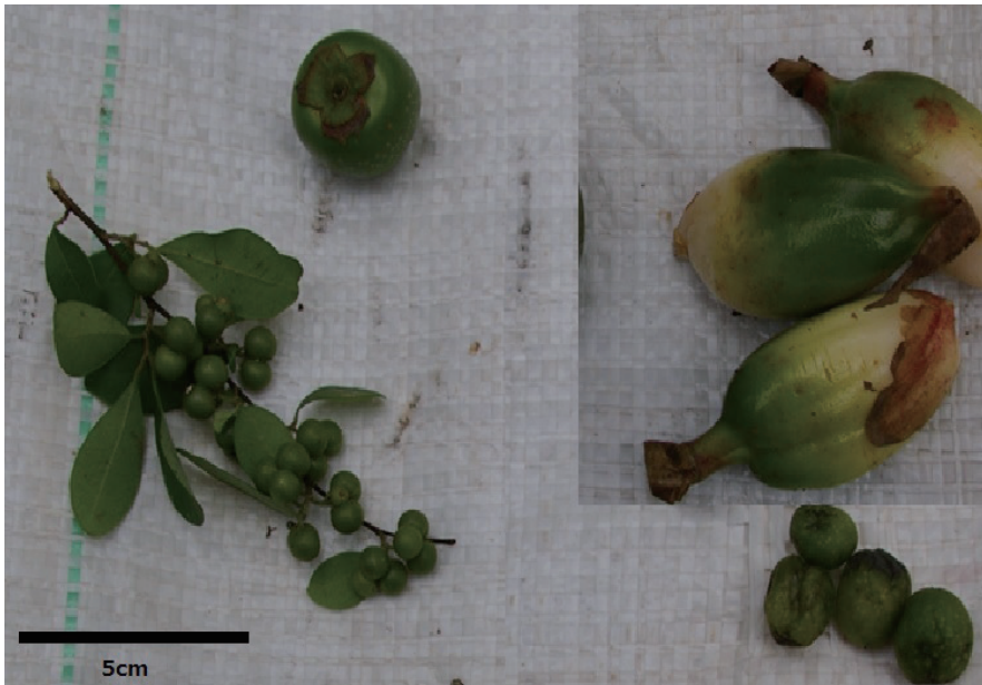
Fig. 4. Foods eaten by chimpanzees during the second half of the rainy season in Ugalla