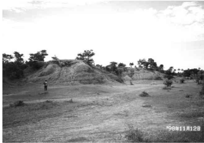
Figure 9. Landscape of the PGN1 (Myinzainggon Kyitchaung) locality.