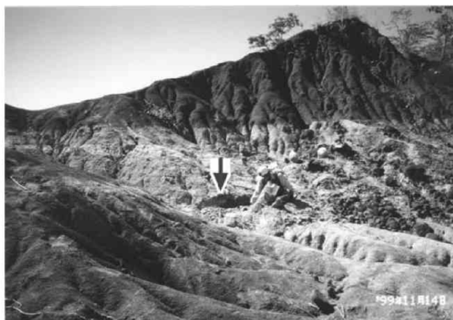
Figure 4. Landscape of the Pk1 (Sabapon Taung) locality, showing a tuff bed (arrow).

2004b, 2004c, 2005, 2006a, 2006b, in press; Gebo et al. , 2002; Holroyd et al. , 2002, 2006; Dawson et al. , 2003; Kay et al. , 2004a, 2004b; Shigehara and Takai, 2004; Takai and Shigehara, 2004; Suzuki et al. , 2004, 2006a, 2006; Stidham et al. , 2005; Maung Maung et al. , 2005; Ugai et al. , 2006).