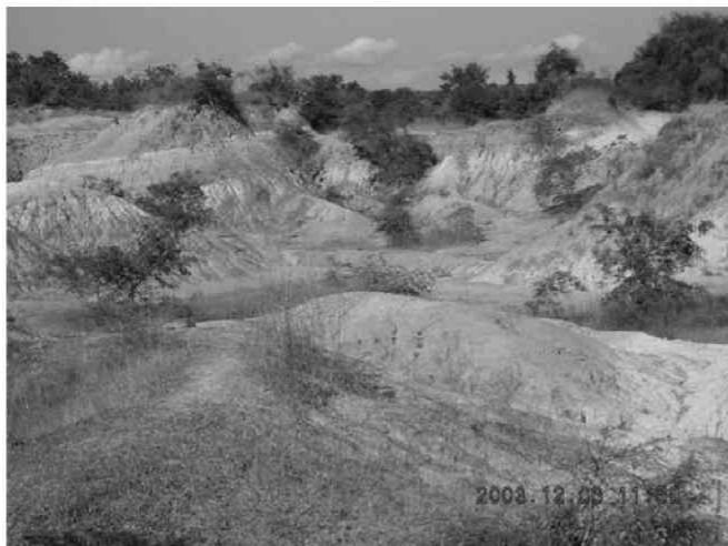
Figure 3. Landscape of the Bh4 locality.