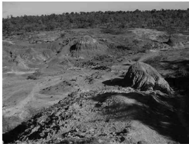
Figure 6. Landscape of the Pk3 locality.

et al. , 2000a; Figure 1). These three main areas bearing fossil localities roughly correlate to the lower part of the “Upper Member” of the Pondaung Formation (Aye Ko Aung, 2004). Although the detailed stratigraphic relationships among the fossil localities are almost unclear, the detailed stratigraphic relationships among the fossil localities near the Paukkaung village in Bahin area were studied by Maung Maung et al. (2005) and Suzuki et al. (2006b).