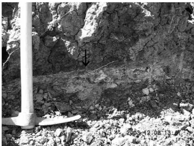
Figure 11. A tuff bed (arrow) at the Bh1 (Yarshe Kyitchaung) locality.