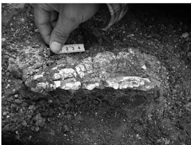
Figure 12. Mode of occurrence of a lower jaw ( in situ ) of Anthracotherium at the PGN1 locality.

such comparison of mammalian faunas is useful for determining the age of Eocene mammal-bearing terrestrial deposits of East Asia when done carefully.