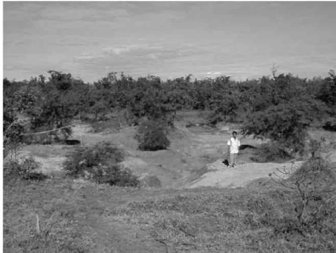
Figure 5. Landscape of the Pk2 locality.