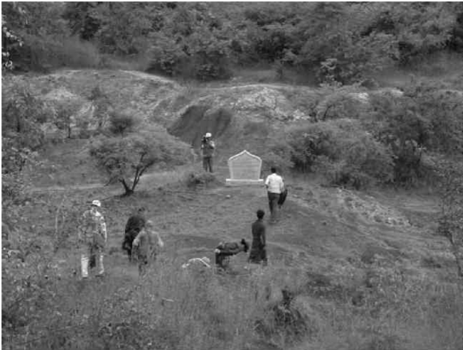
Figure 2. Landscape of the Bh1 (Yarshe Kyitchaung) locality.

Holroyd, 1996; Pondaung Fossil Expedition Team, 1997; Tin Thein, 1997, 2004; Jaeger et al. , 1998, 1999, 2004; Takai et al. , 1999, 2000, 2001, 2003, 2005; Office of Strategic Studies, 1999; Chaimanee et al. , 2000; Tsubamoto et al. , 2000a, 2000b, 2001, 2002a, 2003a, 2003b, 2004, 2005, 2006; Egi and Tsubamoto, 2000; Ducrocq et al. , 2000a, 2000b; Métais et al. , 2000; Than Tun, 2000; Tsubamoto, 2001; Ducrocq, 2001; Ciochon et al. , 2001; Gunnell and Miller, 2001; Shigehara et al. , 2002; Egi et al. , 2002, 2004a, 2004b, 2004c, 2005, 2006a, 2006b, in press; Gebo et al. , 2002; Gunnell et al. , 2002; Ciochon and Gunnell, 2002a, 2002b, 2004; Holroyd et al. , 2002, 2006; Beard, 2002; Dawson et al. , 2003; Marivaux et al. , 2003, 2005; Kay et al. , 2004a, 2004b; Hutchison et al. , 2004; Shigehara and Takai, 2004; Takai and Shigehara, 2004; Beard et al. , 2005; Remy et al. , 2005; Head et al. , 2005; Stidham et al. , 2005; Miller et al. , 2005; Métais, 2006).