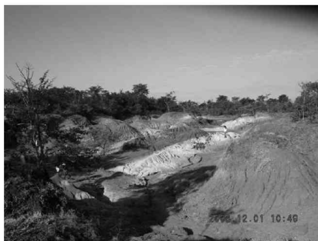
Figure 8. Landscape of the Pk13 locality.

(upper Eocene) on the basis of foraminiferan and molluscan faunas (Stamp, 1922; Cotter, 1938; Bender, 1983). However, the biozone of a foraminiferan from the Yaw Formation, Discocyclina sella D'Archiac (= Discocyclina dispansa sella ), listed by Bender (1983) is now correlated with the Shallow Benthic Zones (SBZs) 15-18, which correspond to the upper part of the middle Lutetian to the upper Bartonian (about 43.5-37 Ma; middle Eocene) (Serra-Kiel et al. , 1998: fig. 5). Therefore, at least the lower part of the Yaw Formation can be correlated with the uppermost Bartonian (= uppermost middle Eocene), and in that case, the Pondaung Formation is automatically correlated with the middle Eocene. The uppermost Bartonian correlation of the Yaw Formation is also suggested by Holroyd and Ciochon (1994, 1995), on the basis of the correlation of the Yaw Formation with the Nanggulan Formation of Java.