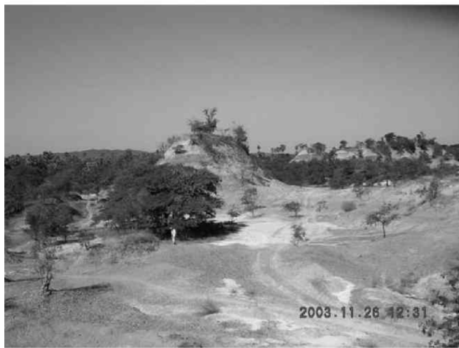
Figure 10. Landscape of the PGN2 (Taungnigyin Kyitchaung) locality.

On the basis of all these evidence, the “Upper Member” of the Pondaung Formation is correlated with the upper Bartonian (= uppermost middle Eocene).