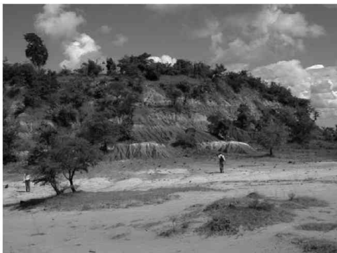
Figure 7. Landscape of the Pk5 (Ayoedawpon Taung) locality.