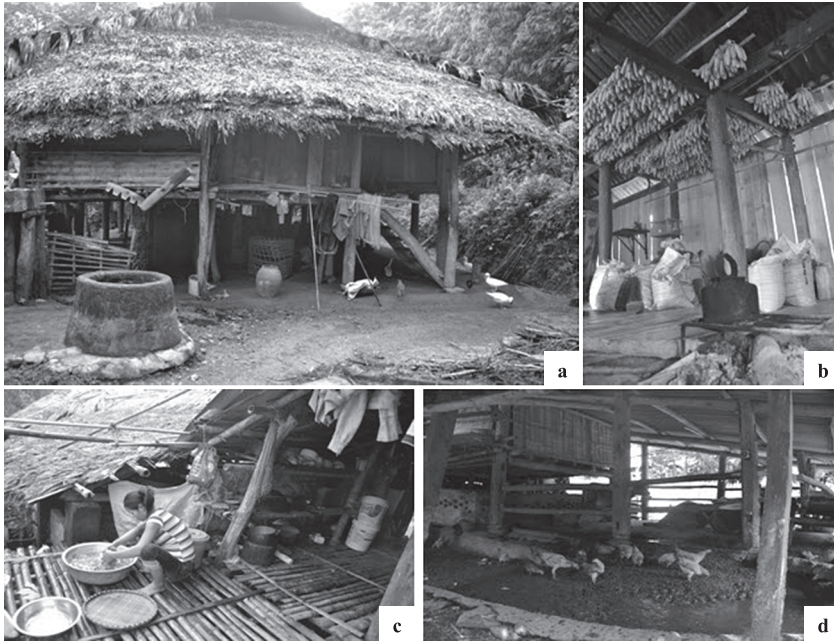
Fig. 2 Traditional Cao Lan Style House and Components; (a) Cao Lan House, Well, and Courtyard, (b) Fire-place inside the House, (c) Balcony, (d) Animal Pens under the House

and heating. The ancestral shrine is mounted on a side wall of the house. Agricultural products such as rice grain and dried maize are stored inside the house. Some houses have large attached balconies built from bamboo where they do laundry and sun-dry food (Fig. 2).