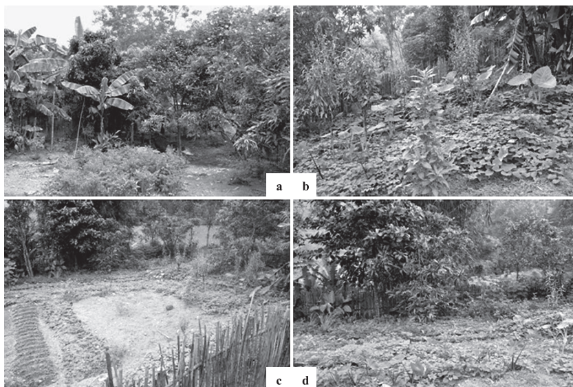
Fig. 3 Homegardens of the Cao Lan of Cao Ngoi Village; (a) Organic, Multi-level and Overlapping Canopy, (b) Polycentric and Multi-species, (c) Indeterminate Boundary, (d) Multi-level and Multi-species

(88%) having 5 levels. More than half (56%) of the gardens have more than 50% of their planting area covered by overlapping vegetation layers.