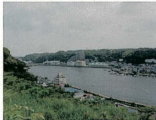
Fig. 1 Study site, Uruga bay, Japan.

maximum bottom depth of the study site is approximately 10 m. The circumference of the bay consists of vertical seawalls with an inlet in the innermost area. The sea bottom is flat and primarily mud, but there was a small rocky area approximately 15 m east of the capture point of the black rockfish S. cheni .