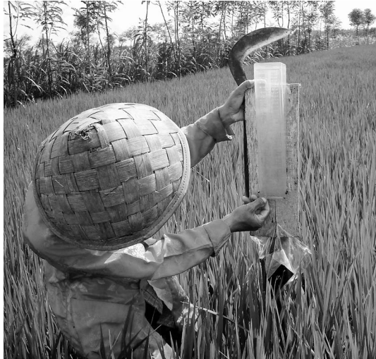
Photo 1 USA Farmer Rain Gauge in Farmer's Field, Wareng, Gunungkidul