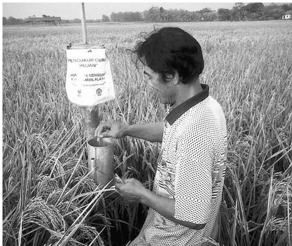
Photo 2 A Farmer in Indramayu Measuring Rainfall Using a Cylindrical Farmer Rain Gauge Source: Photo by Dwisatrio, 2011.