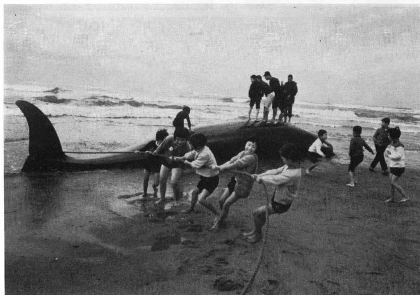
Fig. 2. Berardius bairdi stranded at Sakata, Yamagata Prefecture, October 12, 1968.