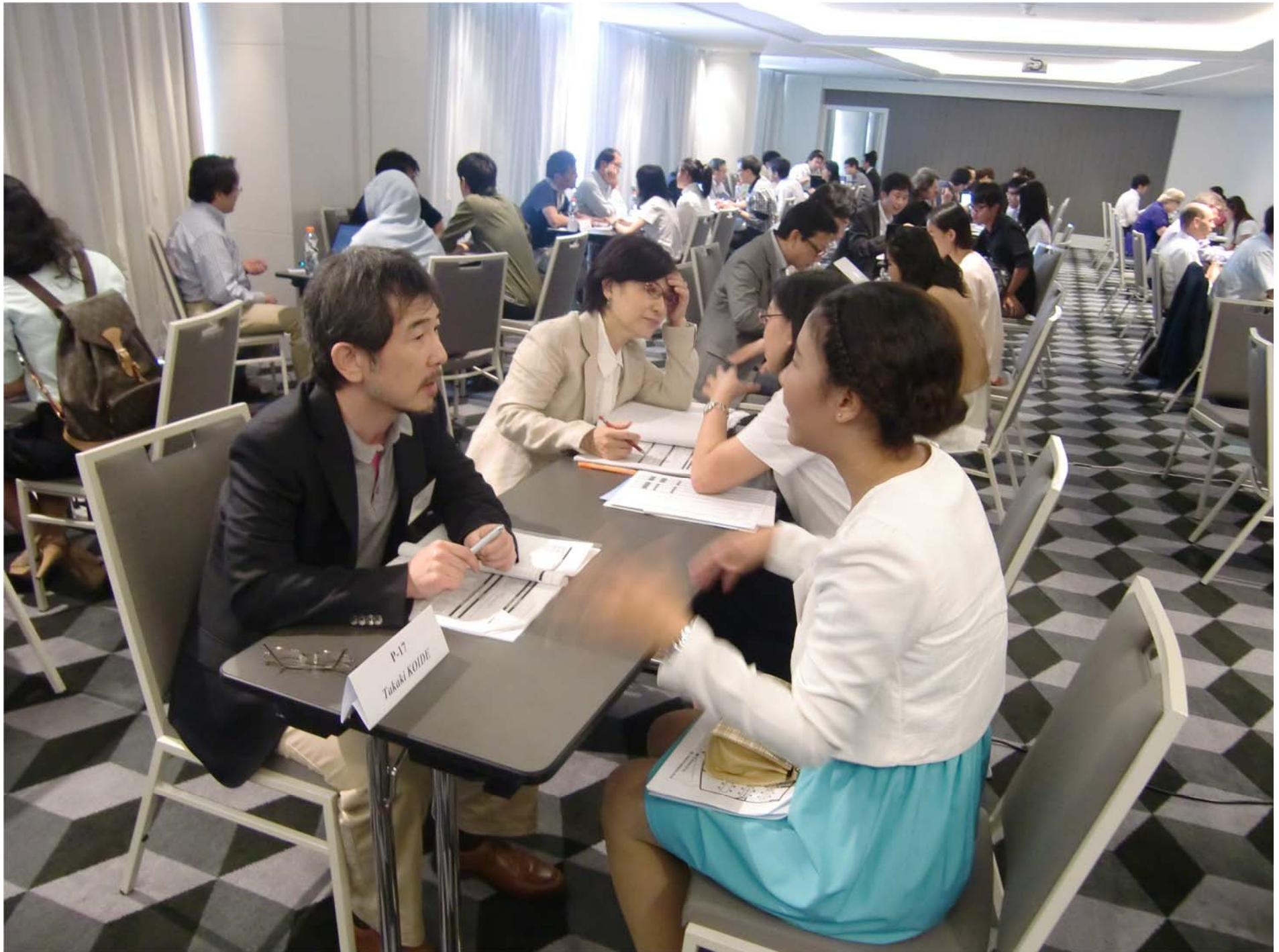
Figure 2. 36 ACBI Professors interviewing 36 Thai Students