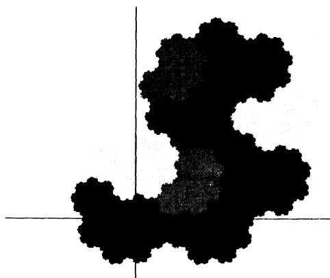
Figure 1: \beta : \beta^3 - \beta - 1 = 0