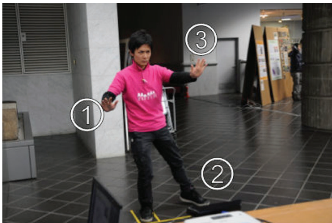
FIG. 2. Numbered instructions for the Dual-Task Tai Chi test (see text). Color images available online at www.liebertpub.com/g4h

walk 10 m during this walk was measured using a stopwatch. The ST walking score was the average time recorded for two trials. In the FR test, each participant was positioned next to a wall, with one arm raised at 90° and fingers extended. A yardstick was mounted on the wall at shoulder height. The distance the participant could reach while extending forward from an initial upright posture to the maximal anterior leaning posture without moving or lifting the feet was visually measured in centimeters as the third fingertip position against the mounted yardstick. The distances measured in two trials were averaged to obtain the FR score. In the TUG test, participants were asked to stand up from a standard chair with a seat height of 40 cm, walk a distance of 3 m at a normal pace, turn, walk back to the chair, and sit down. The time recorded in two trials was averaged to obtain the TUG score. In the OLS test, participants were instructed to start from a position with a comfortable base as support, with eyes open and arms along the side of the trunk. They were then instructed to stand unassisted on either leg. The OLS time was the number of seconds from when one foot was lifted from the floor to when it touched the floor again or the standing leg. In the 5-CS test, participants were asked to stand up and sit down five times as quickly as possible. They were timed from the initial sitting position to the final standing position, at the end of the fifth stand.