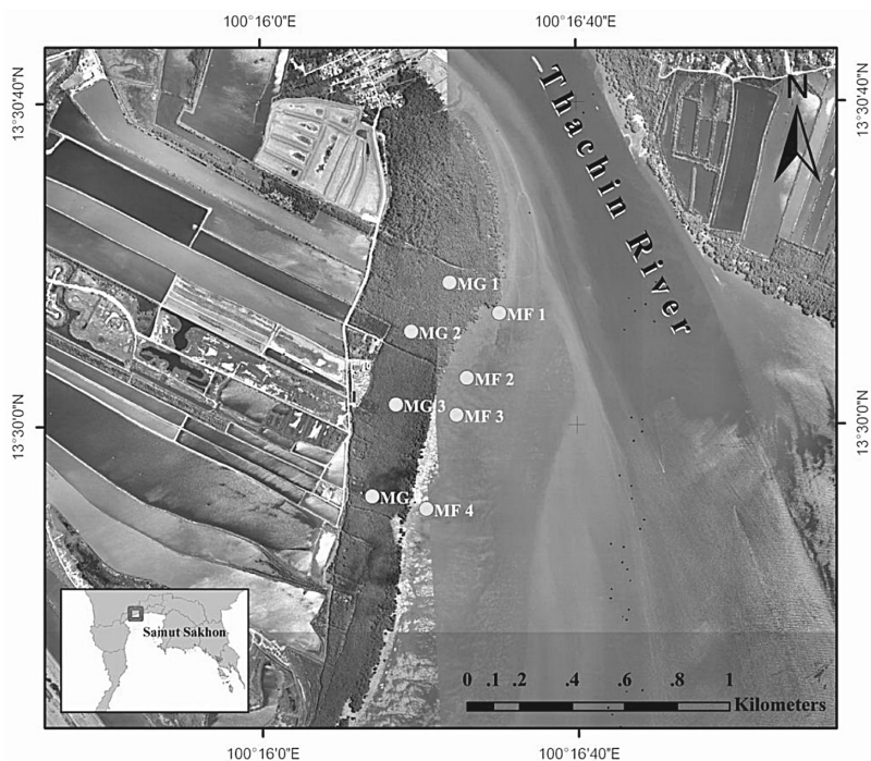
Fig. 1. Map showing eight sampling stations in the mudflat and mangrove habitat, western Thachin River mouth, Samut Sakhon, Thailand.

Species diversity ( H' ) index and Pielou's evenness ( J' ) index of nematode community structures