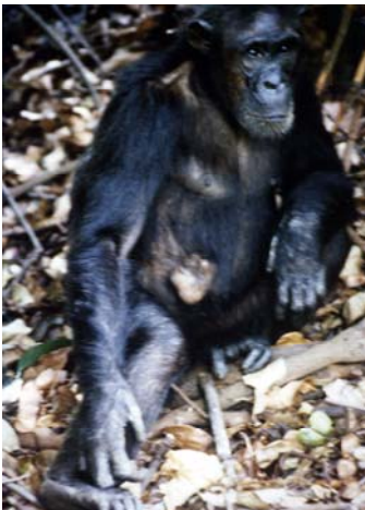
Fig. 2 It is likely that Gwekulo had a secondarily infected boil on the subcutaneous tumor.

This type of tumor might be benign because we have not confirmed the subsequent deaths of victims. However, it could sometimes be a serious condition for them: Once (outside of the periods above) TN observed that an old female, Gwekulo, had developed a huge tumor that emitted pus from the affected area (Fig. 2). It was not