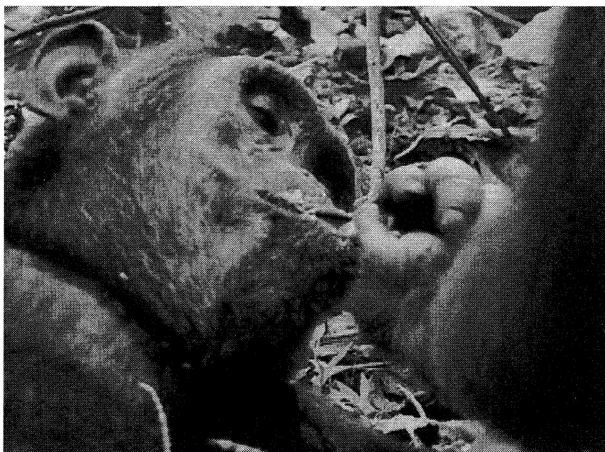
Figure 3. DG (right) obtaining pulp from MA's (left) mouth.

It is difficult to make any generalization from these two cases. There were differences in the sizes of the fruits, the ways of begging and sharing, the activeness of the sharer, or the availability of the fruits. However there are also common features, such as both interactions being dyadic without vocalization or aggression. Such characteristics of interaction are more similar to that between mother and infant, where the latter's taking food from the former can be tolerated, than that between individuals in meat sharing (9). It is noteworthy that adult males, who are more aggressive than individuals of any other age/sex class, can show such a high degree of tolerance as that between mother and offspring in some cases.