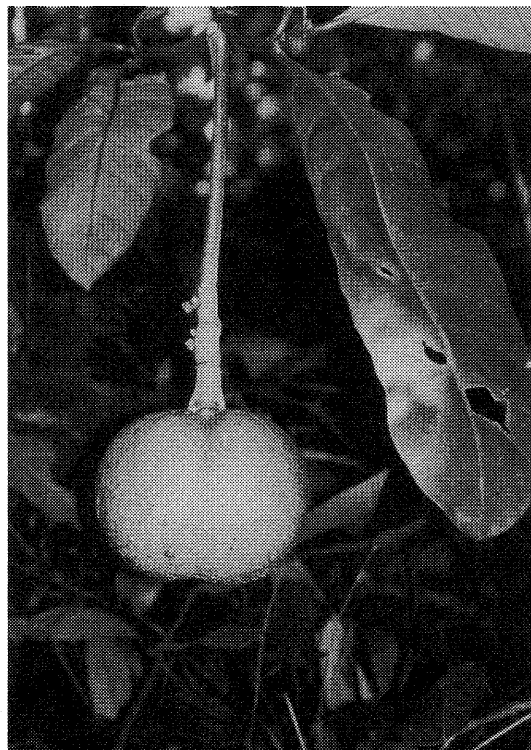
Figure 2. A Voacanga africana fruit.