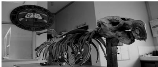
Fig. 3 A reconstructed dugong skeleton found at SPAMAST, Malita, Davao del Sur