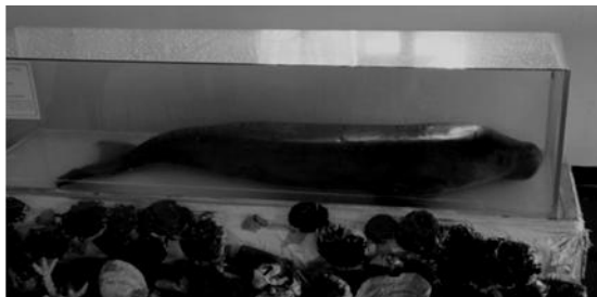
Fig. 4 A 1.2m long and 70 kg female baby dugong preserved whole in formalin solution