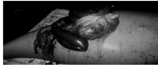
Fig. 6 A decomposing carcass of a 240cm and 400 kg dugong