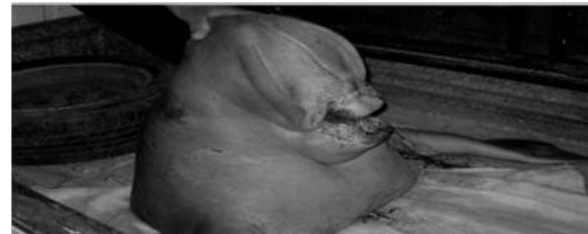
Fig. 7 The head of a butchered dugong