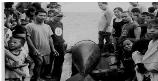
Fig. 5 A 220cm long male dugong found by fishermen entangled in net