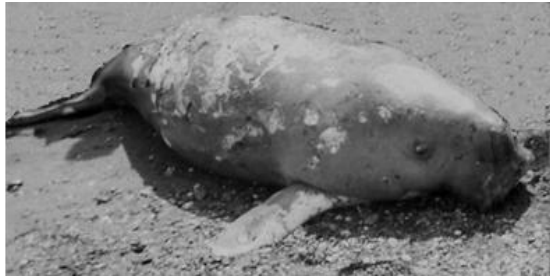
Fig. 2 A 244cm long dugong with stab wound at the dorso-caudal part of the body

August 18, 2008, a tail fluke was brought to the research station (Figure 8) which could be that of the head of the dugong retrieved the previous day. However, there was uncertainty because the fluke seemed small for the head. It could be a tail fluke of a baby dugong.