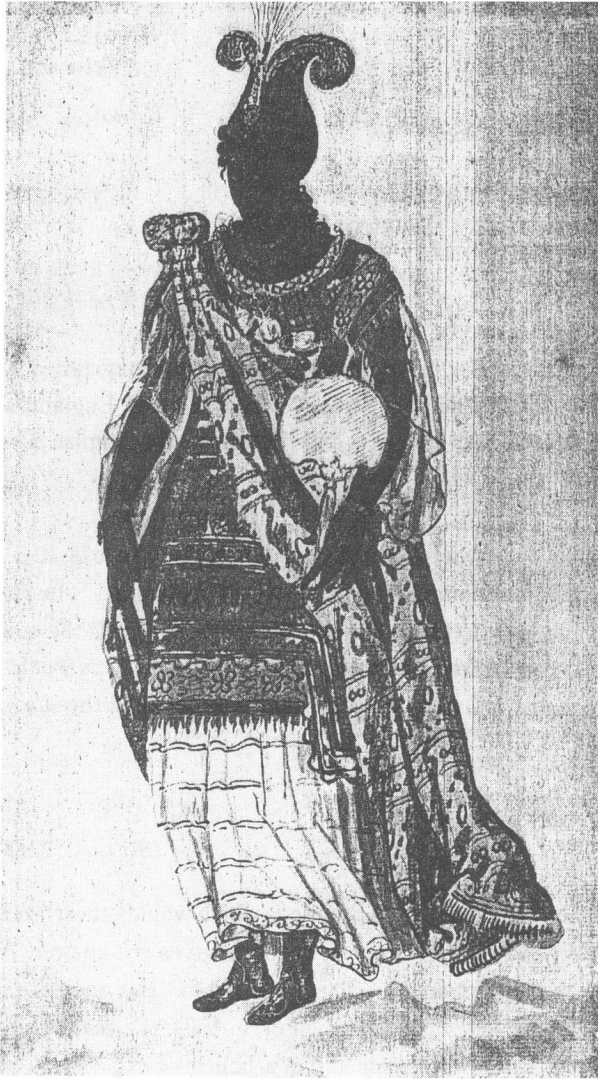
Fig. 3 Inigo Jones's design of a masquer's costume: Niger's daughter. Stephen Orgel and Roy Strong, Inigo Jones: The Theatre of the Stuart Court , 2 vols, (London: Sotheby Parke Bernet, 1973), Vol. I, p. 88.