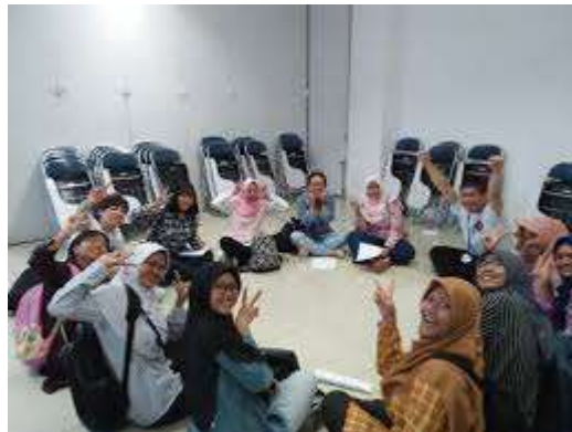
Figure 1. Classroom learning

Adjusting to a new format was not somewhat easy thing. The unpraped teaching design forced teacher to develop pedagogical strategies to customize their teaching to the level of their students.