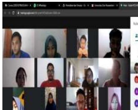
Figure 2. Distance learning

Figure 1 showed that all students were together in class room, they can create social interaction between each other. Teacher can stand in front of classroom and made discussion during the class. Meanwhile Figure 2 described students and teachers really depend on internet connection, they had lack of social interaction because they were in different area. Both classroom and distance learning had strong and weaknesses in teaching learning process.