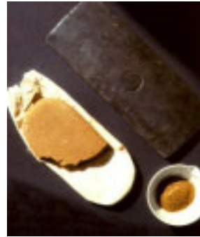
Figure 3. Cannabis plant, and its resin and fine powder (Hashish).