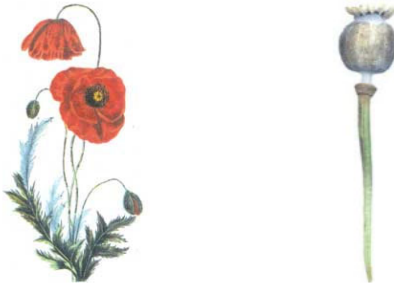
Figure 2. The “poppy” plant with its characteristic red flowers, and the notorious capsules.

Figure 1. The large and soaring share of Afghanistan in the global production of opium in recent years. Between 1994 and 1998, annual opium output was between 2,000 and 3,000 metric tons of raw material. The majority of this was turned into morphine and heroin in Turkey, and to a lesser extent in Pakistan and in certain Central Asian republics and the Caucasus. Only a fraction of the opium was transformed inside Afghanistan. All previous records were broken in 1999 and 2000 when opium production in Afghanistan reached 4,500 and 3,200 tons respectively.