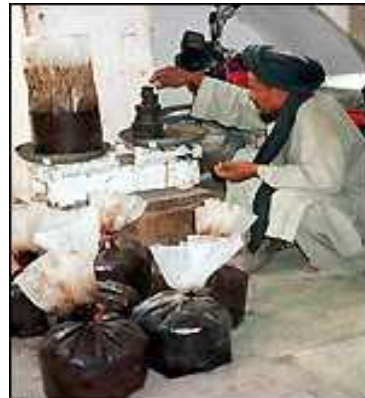
Figure 4. Many of the factories that are used to process opium into different types of Heroin, may be nothing more than a shack.