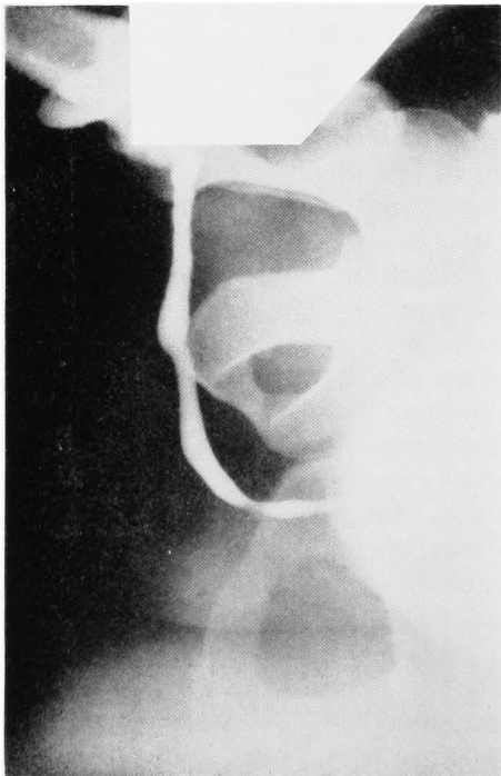
Fig. 3. Retrograde urethrocytogram showing new urethral orifice opening at the tip of the glans

sition could be done successful and penile erection was noted with no evidence of a ventral curvature (Fig. 3). Post-operative course of hormonal adjunctive therapy with testosterone enanthate was planned.