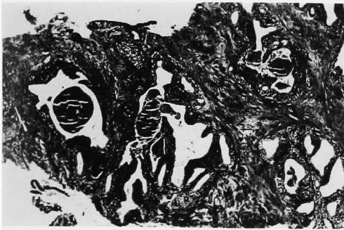
Fig. 2. Histology of the biopsy material taken after 3 weeks of steroid therapy, showing marked reduction of granuloma. H&E, reduced from \times 40

titis has been widely discussed. Most of the previous cases were treated by TUR-P. Successful treatment of granulomatous prostatitis with steroid was first described by Bush et al. 8) Although some reports have been made on the treatment of granulomatous prostatitis with steroids, little is mentioned about the dose schedule and time limit of steroid therapy. In this case, we started with steroid (prednisolone) therapy of 30 mg/day and tapered to 5 mg/day after about two weeks. The symptoms were improved within a few days but treatment with a low dose of steroids had to be continued for about two months for the complete improvement of clinical signs (digital rectal palpation of the prostate). Check prostate biopsy done after three weeks of steroid therapy showed regression of