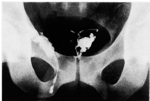
Fig. 1. Vesiculography shows extensive obstruction and extravasation of the contrast medium in the right vas deferens, but patency in the opposite one.