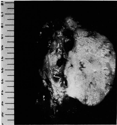
Fig. 5. Gross appearance of cut surface of the postmortem specimen revealed metastasis to the middle of the right kidney.