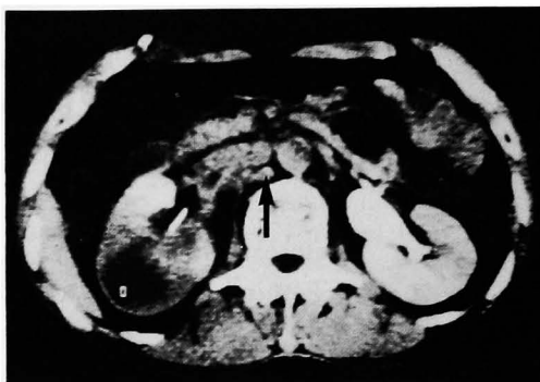
Fig. 3. Contrast-enhanced CT showed a low density mass in the right kidney and hilar lymph node involvement (arrow).

He was rehospitalized to Gifu University Hospital 3 months later with right flank pain and general malaise. Physical examination disclosed a severe anemic state and decreased respiratory sound in the left lung field. Bloody pleural fluid was obtained and its cytologic examination revealed class V adenocarcinoma. Systemic