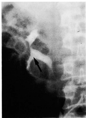
Fig. 2. Retrograde ureterogram showed multiple nodular appearance in the right pelvis (arrow).