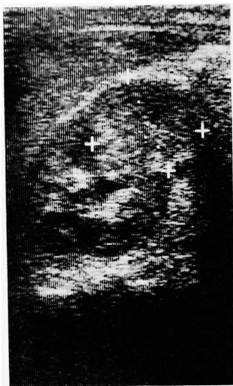
Fig. 1. Renal sonography: An ill-defined echogenic mass was found in the right kidney.