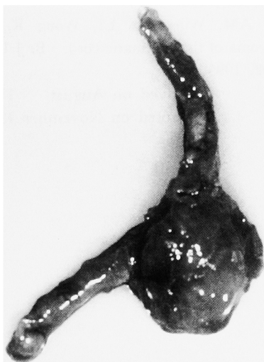
Fig. 1. Macroscopic appearance of the resected specimen. Upper; vas deferens. Center; tail of the epididymis with surrounding fat. Lower left; head and body of the epididymis.

extending along the left spermatic cord. Laboratory studies including urinalysis were negative. High-resolution inguinal sonography showed an isoechoic, thick spermatic cord but did not show the "whorled appearance"; typical of leiomyomas developing in other sites. We considered inflammatory disorders, such as tuberculosis. In order to identify the linear structure, an operation was performed through a left