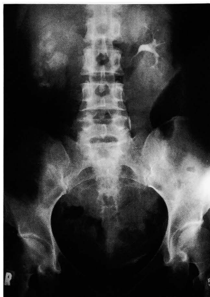
Fig. 2. DIP showing right renal stone and hydronephrosis.

passage was favorable, and DIP confirmed the disappearance of hydronephrosis and complete stone passage on October 9, 1999. Infrared spectrophotometry showed that 98% or more of the total stone mass was composed of ammonium acid urate (Fig. 3).