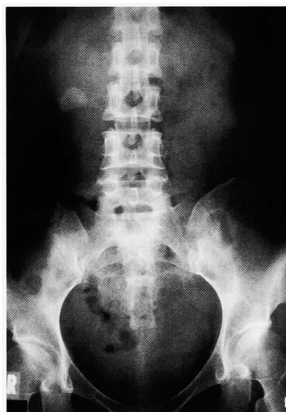
Fig. 1. KUB showing right renal stone.

A 32-year-old Japanese woman consulted a practicing urologist because of having right back pain and cloudiness of urine on July 21, 1999. Drip infusion pyelography (DIP) revealed a stone in the right kidney, and she was introduced to the Department of Urology of our hospital to receive extracorporeal shock wave lithotripsy (ESWL). In the past history, urinary occult blood was detected in the pre-operative examination of chronic tonsillitis in April 1991, but had been left untreated. She had urolithiasis in the right urinary tract in March 1997. The stone was naturally discharged, but the details including its components were unknown. On admission she was 157.5 cm in height and 44 kg in weight. The loss of body mass index (BMI) was 5 kg/m 2 and her menstruation was normal. Hematology, biochemistry, endocrinological tests and blood gas analysis revealed no abnormalities. The 24-hr urinary excretion study revealed a urine volume of 1,000 ml, pH of 6.0, and normal urinary chemistry. Urinalysis revealed more than 100 white