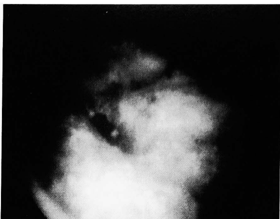
Fig. 2. On cystoscopy, there were severe inflammation and encrustation of almost two-thirds of the bladder mucosa. Figure shows right ureteral orifice.