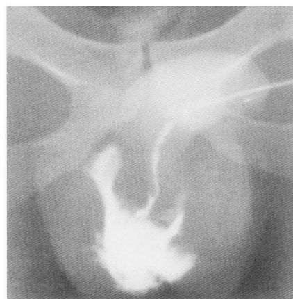
Fig. 1. Retrograde urethrocytogram. Front projection image showing extravasation from the torn bulbar urethra.

Physical examination did not indicate any other acute injuries, including those of the head, face, neck, abdomen, back, or the extremities, nor any neurological injuries. Neither scrotal tenderness, discomfort, nor abnormal findings were found by palpation ( i.e. , there was no palpable mass or irregularity on the surface of the scrotal contents). The patient had no history of either severe scrotal trauma or inflammation. Retrograde