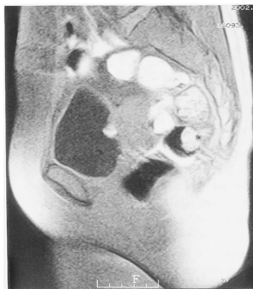
Fig. 1. MRI (sagittal plane) showed a demarcated mass with a high signal intensity on T1-weighted images.

A 54-year-old woman was admitted to the Department of Internal Medicine in our hospital for screening on December 10, 2002. A urinary bladder tumor was incidentally detected on abdominal ultrasonography. It was a 1.0×1.0 cm well-defined, solid echogenic mass. She was referred to the Department of Urology. She was 160 cm tall and weighed 57.5 kg. Her pulse was 72 beats/min. Her blood pressure was 120/80 mmHg. Findings of physical examination were unremarkable. She had no history of hypertension, and was taking no medications. Laboratory data, including complete blood count, blood urea nitrogen, creatinine, electrolytes and urinalysis, were normal. Urine cytology yielded a class II result. Blood noradrenaline and adrenaline levels were not measured since the tumor had not been diagnosed as a pheochromocytoma of the urinary bladder prior to surgery. Cystoscopic examination revealed a 1 cm broad-based, non-papillary submucosal tumor in the posterior wall of the bladder. The surface was covered by nearly normal mucosa. Pelvic magnetic resonance imaging (MRI) revealed a demarcated