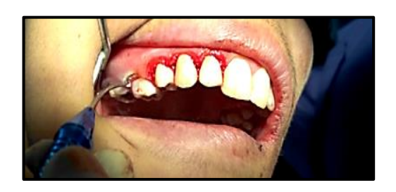
Figure 3. Gingivectomy with laser

It was observed that diode laser provides adequate hemostasis and accurate incision margins. Postoperative advantages of laser includes lack of pain, swelling and less scar tissue formation and good and uneventful wound healing.<sup>4</sup> The wounds induced by laser heal via reparative matrix proteins synthesis. These matrix proteins in the tissues resist against laser ablation and their slow removal and replacement from the tissues causes less tissue scarring and wound contraction in laser treated areas.<sup>5</sup>