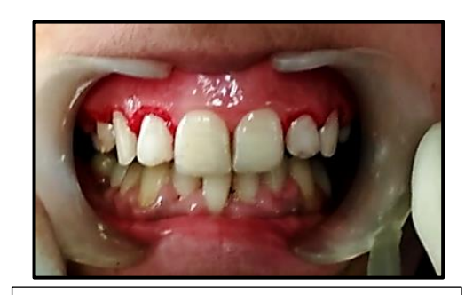
Figure 4. Immediate postoperative view

For postoperative pain and discomfort, no significant difference was noted in the first two days, laser treated tissues generally exhibit less pain which can be attributed by the formation of protein coagulum formed on wound surface, thus acting as a biological dressing and sealing off the nerve endings.<sup>6</sup>