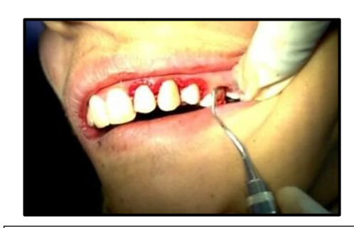
Figure 2. Gingivectomy with scalpel & granulation tissue removal

enlargement and on examination, probing and plaque accumulation was not seen. It was also observed that after surgical procedure, patient had understood and was practicing good oral hygiene.