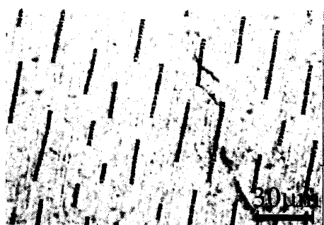
Figure 1: Chain structure of silicon oil.

In addition, we have succeeded in the formation of the crystal-like structure shown as Fig.2 by applying the alternating electric field after the chain structure has been formed. A colloid crystal that consists of the \mu\text{m} -size particles attracts attention of many researchers as a photonic crystal. Though Musevic et al. formed colloidal crystal by optical tweezers [2], it has not been reported the formation of colloidal crystal by using the phase separation of the liquid crystal and the polymer. Details of the controlled structure and the formation dynamics will be discussed.