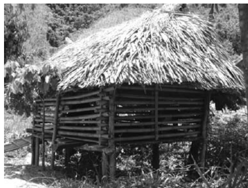
Fig. 4 Mr Son's goat house (Photo taken by Iizuka, 12 July 2007)

Project members continue to observe the goats and encourage meetings among the households. Future meetings are planned, which will enable the five house-