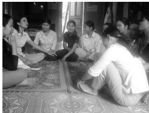
Fig. 2 A group discussion among young women in Pa Ring hamlet on 9 December 2006

The information obtained through the questionnaire survey and the group discussions provided a basis for community walks with local people. These walks served two main functions. First, they gave project members a clear and visual understanding of issues raised by local people during the questionnaire survey and discussions. For instance, people who lacked land because of soil erosion could show project members exactly where the damage was taking place by