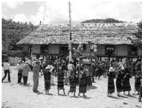
Fig. 3 Dancing in celebration at the opening ceremony of Hong Ha's community house

Discussions to build a community house began in July 2006. Many villagers