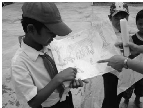
Fig. 6 A young boy shows his picture at the "Environment and People" painting contest hosted by his school on 12 May 2007

A second environmental education activity was organised by the two schools in May 2007, when 100 pupils took part in a painting contest on the theme of "environment and people". In this activity, the pupils had an opportunity to think about their attitudes to the environment and express their perceptions and ideas through their paintings. All students submitting pictures were also required to make a speech explaining the concept behind their paintings. A great deal of effort went into the paintings and the colourful and beautiful works submitted by the students vastly exceeded the expectations of their teachers (Figure 6). Students were less expressive when called upon to speak — they were more than a