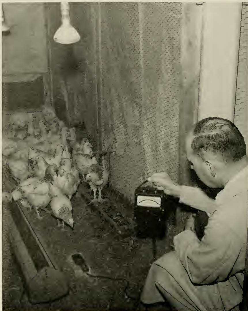
Figure 2. Method of obtaining light intensity readings with Weston Illuminator Meter.

Heat was provided by a hot water system with fin-type radiation along the outside wall. The wire partitions between pens were covered with a light tan colored sisal kraft building paper and a 12" Masonite panel at the bottom. All windows were covered with a baffle of burlap located so