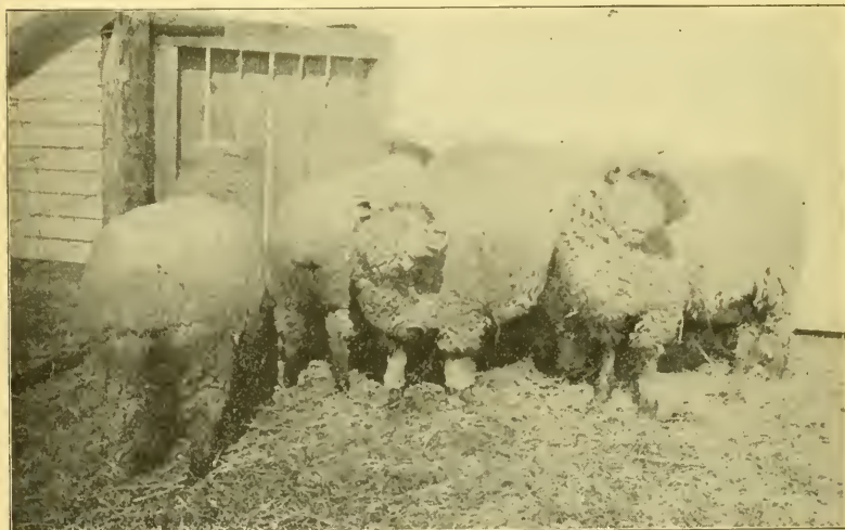
Lot II.—Fed Native Hay