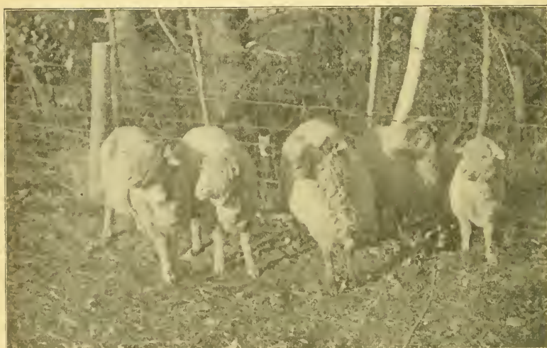
Lot III.—Fed Clover Hay