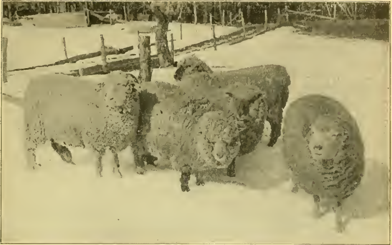
Lot I.—Fed Dry Rations