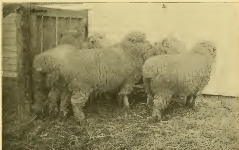
Lot II.—Fed Turnips