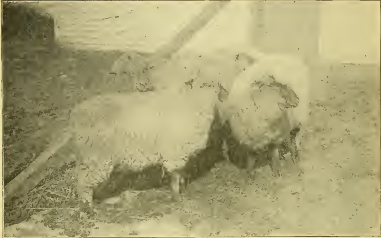
Lot I.—Fed Clover Hay