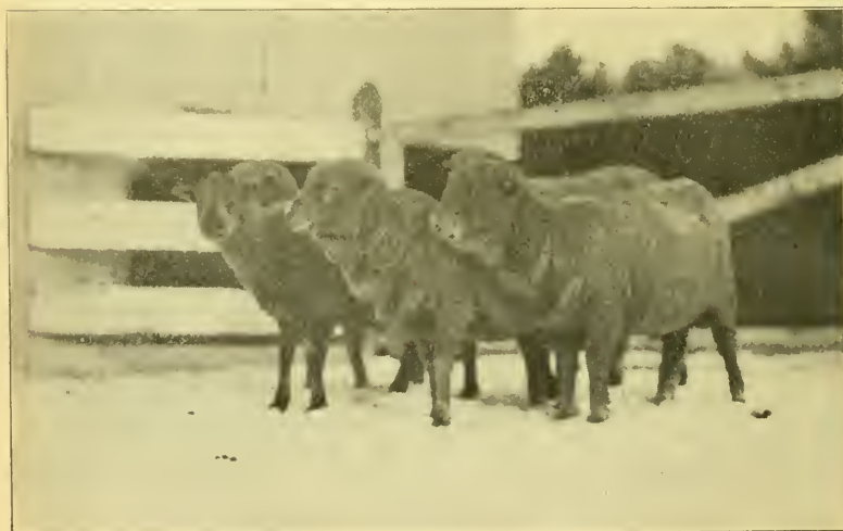
Lot IV.—Fed Native Hay