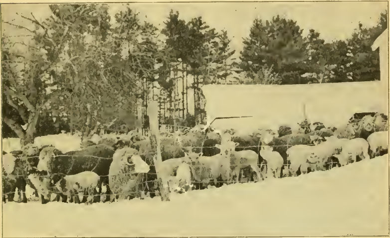
The Shepherd's Harvest