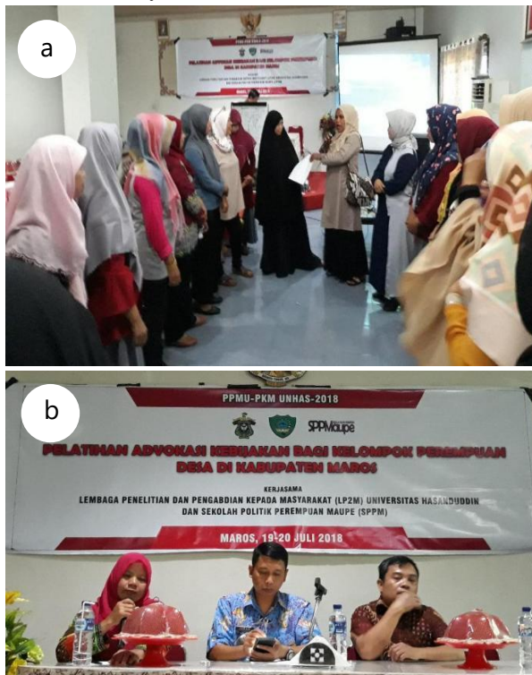
Figure 2. Activities of policy advocacy training: (a) Brainstorming of issues of women's violence; (b) Delivery of the topic policies and programs of policy advocacy

This advocacy training was carried out over two days, namely on 19-20 July 2018 at the RM Nusantara Turikale Hall, Maros Regency. The training participants consisted of a group of 25 women. The women's group that participates in this advocacy training is a group of village women who have long been assisted by SPPM Maros.