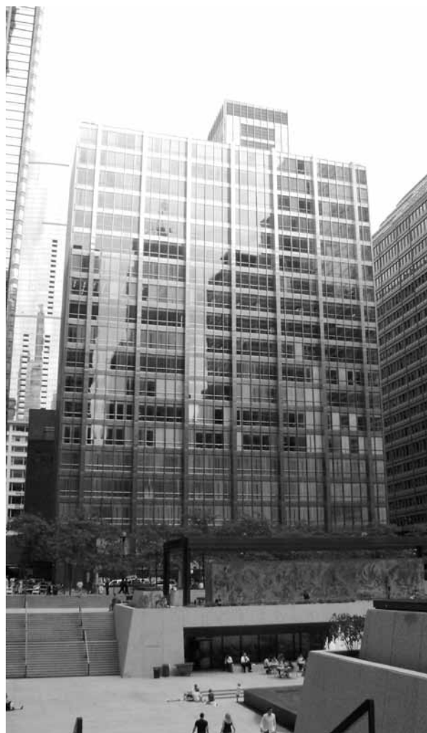
The 1957 Inland Steel Building in Chicago was designated as a city landmark in 1998 and listed in the National Register of Historic Places in 2009.

While the National Register program clearly states that the 50-year criterion is not meant to exclude or prohibit resources from being considered for listing, in practice, the percentage of resources in the National Register with periods of significance ending in the previous 50 years is quite small. Since the mid 1970s recent past resources (those less than 50 years old at the time of their inclusion)