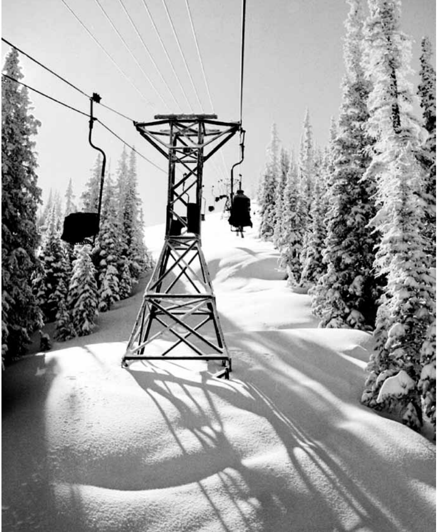
Lift #1 was the longest chair lift in the world when it opened in 1947. The City of Aspen/Pitkin County designated Lift #1 as a local landmark in 1974.