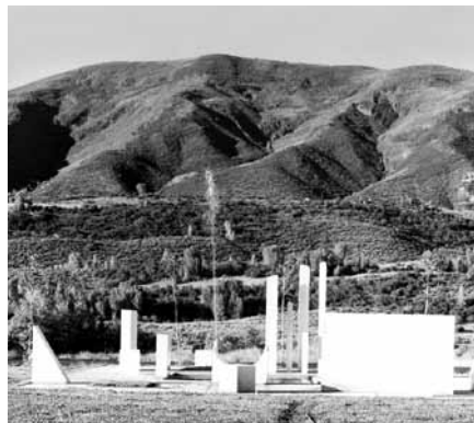
Above: The 1955 Marble Garden at the Aspen Institute, designed by Herbert Bayer, was designated a local landmark in 1996.

The survey of communities with relaxed or no age criteria also showed that operating without an age guideline is not without its pitfalls. Staff in the local preservation program in Aspen, Colo., for example, have worked proactively for more than ten years to designate some of the city's later 20th-century heritage, including examples of modern, rustic, and chalet-style homes. Their efforts have