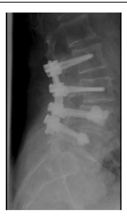
Fig.3 Extension of the posterior fixation with transpedicular screws in L2 and L3 \,