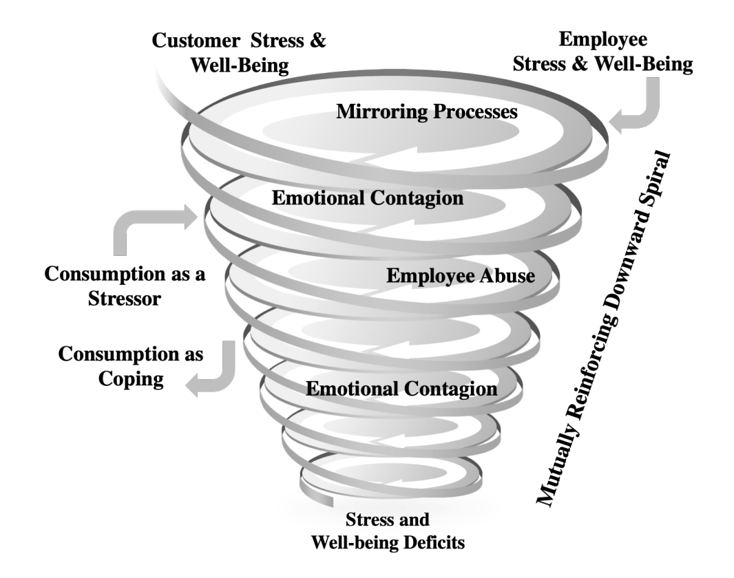
Figure 2. Conceptual model of the customer-employee stress mirroring downward spiral.