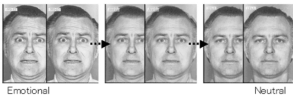
Figure 1. Illustrations of stimulus presentations, forward (upper) and backward (lower). Note that the frames were the same for the two conditions.