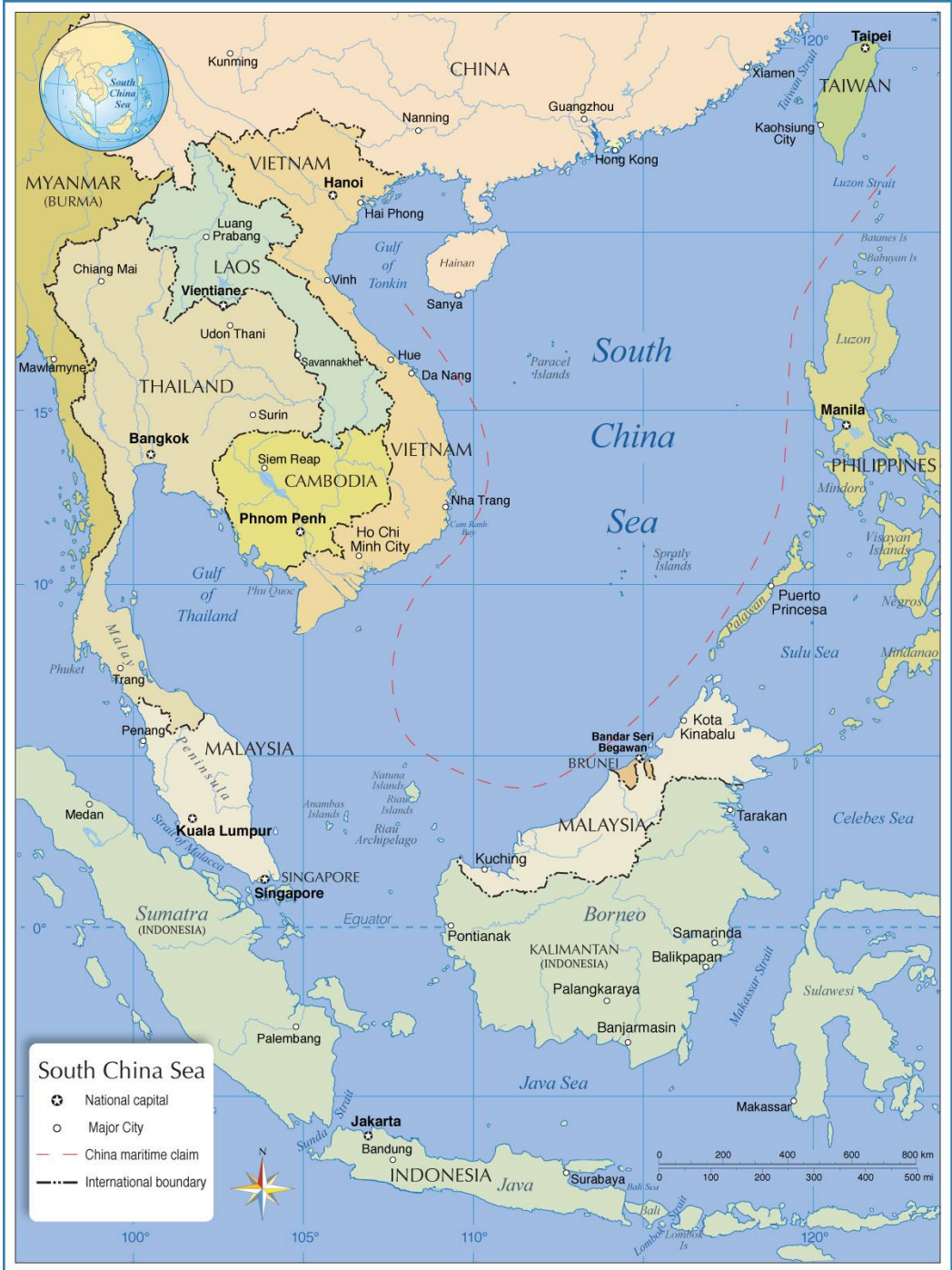
Map of South China Sea with Coastal States.