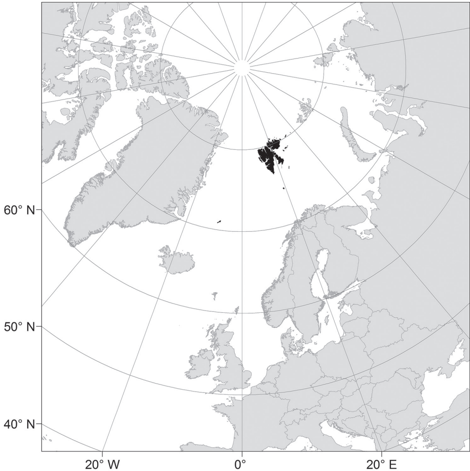
Figure 1. Geographical location of the study site Svalbard (highlighted in black).