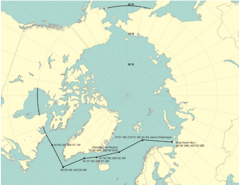
Figure 2. Maximum extent of Arctic waters application.