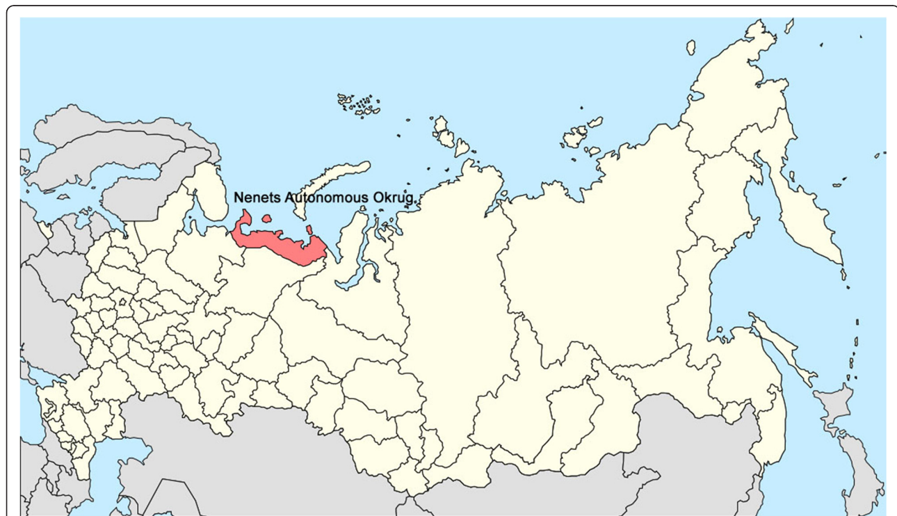
Fig. 1 Map of Russia and the Nenets Autonomous Okrug.

The present study is a retrospective population-based mortality study of all suicides that occurred in the NAO and in all of Russia from 1 January 2002 to 31 December 2012 [24]. The NAO is situated in Northwestern Russia, close to the Arctic Ocean (Fig. 1). According to national census data, the total population of the NAO was 41,546