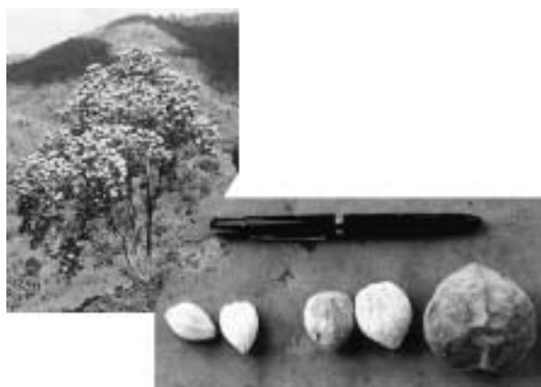
Photo 1 Tree Form and Fruit of Kemiri

Generally, one fruit includes two seeds. Each seed covered with a hard shell contains a fat-abundant endosperm (albumen).