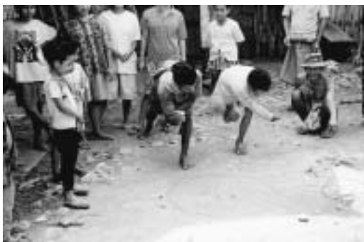
Photo 3 Villagers Demonstrating the Kemiri Game

The villagers kindly demonstrated the game as soon as the use of kemiri in games was mentioned during a break between interviews. The players are usually children, but here the adults are playing it for demonstration.