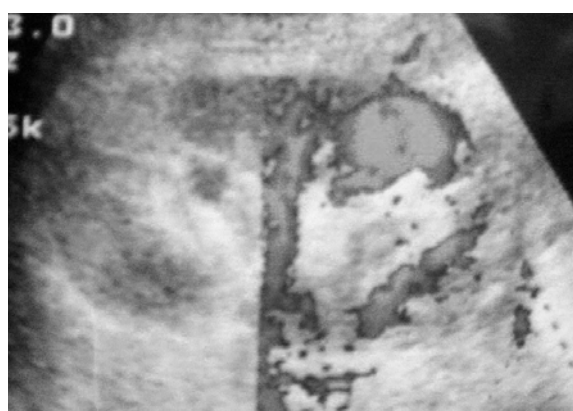
Fig. 1. Color Doppler ultrasound shows a vortex circulation in the lower pole of the right kidney.

On POD 23, the patient returned complaining of gross hematuria and right flank pain. He was re-hospitalized due to significant drop of hemoglobin (7.9 g/dL) and slight increase of serum creatinine (1.2 mg/dL), but he was hemodynamically stable. A high vortex circulation in the lower pole of the right kidney was revealed by color Doppler ultrasound (Fig. 1). Contrast CT scan showed an early enhanced lesion 1 cm in diameter in the