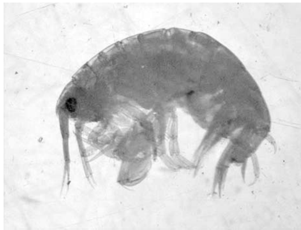
Fig. 1. Leucothoe spinicarpa (Abildgaard, 1789).

Leucothoe spinicarpa was the only amphipod found inside the tunicate Ecteinascidia thurstoni (Figures 1, 2). 2.2% of the tunicate zooids acted as hosts, with most zooids containing no amphipods